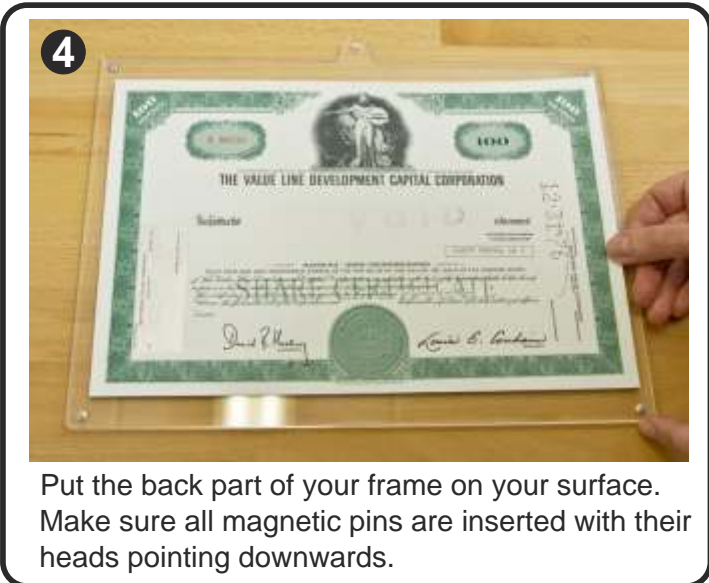
Put the back part of your frame on your surface. Make sure all magnetic pins are inserted with their heads pointing downwards.