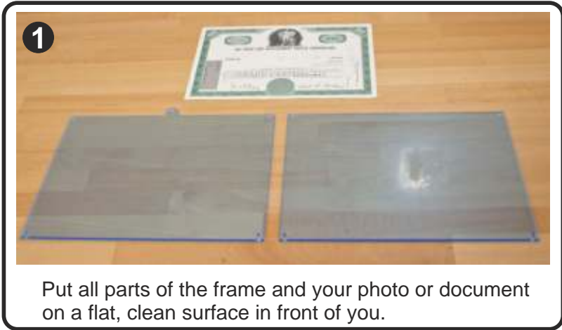
Put all parts of the frame and your photo or document on a flat, clean surface in front of you.