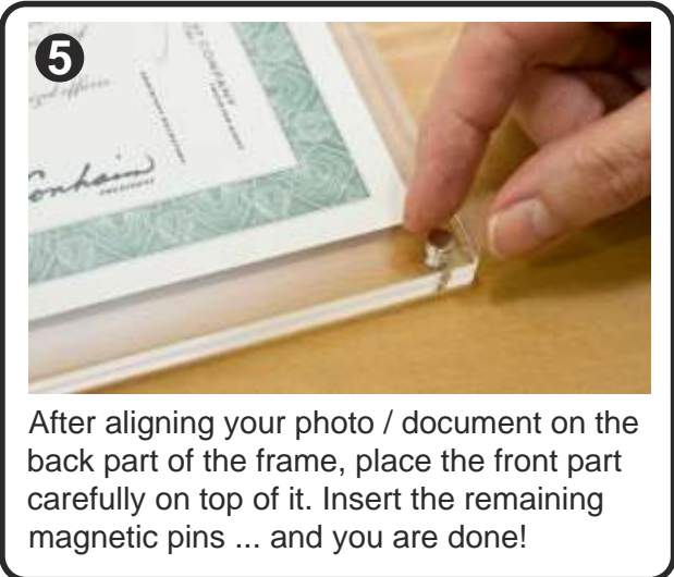
After aligning your photo / document on the back part of the frame, place the front part carefully on top of it. Insert the remaining magnetic pins ... and you are done!

Cleaning instructions : Please do not use any cleaning agents other than water or special acrylic care products. Many other cleaning agents contain solvents, which can damage the acrylic glass. If you have any further questions, please contact us by e-mail or telephone.