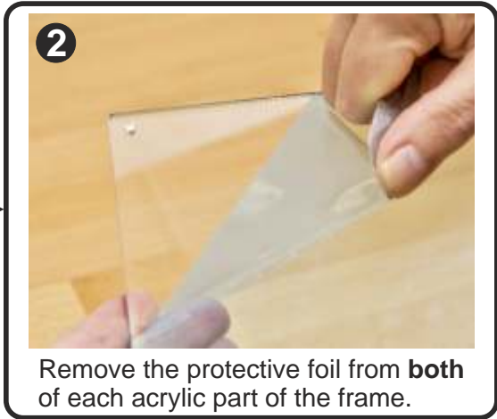
Remove the protective foil from both of each acrylic part of the frame.